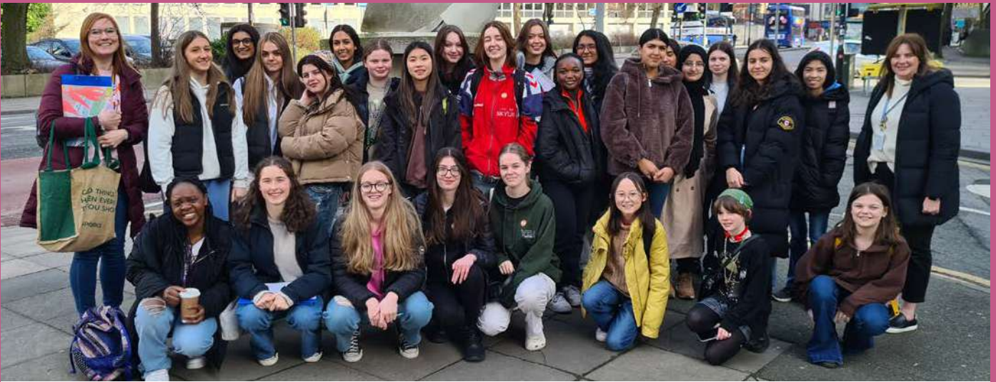
PSHE trip to the People's History Museum